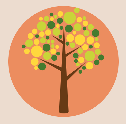
Nature & Outdoor Usage of the enviroment as tool for learning