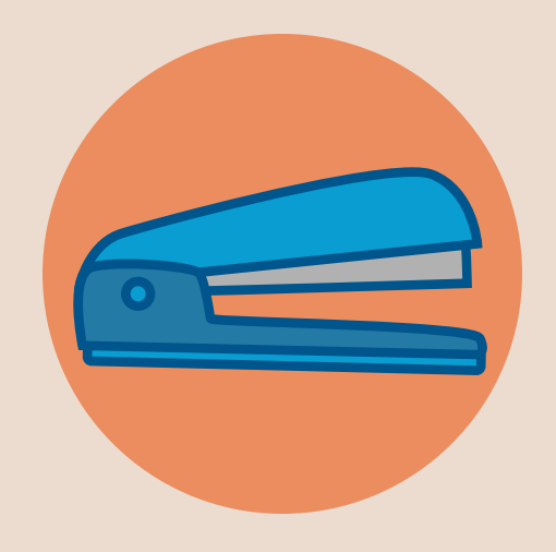
Connectivities Experiential learning assignments & challenges

This is a personal development training and we are going to use the method learning by involvement. Throughout the 4 days of the training we are going to use amongst others: