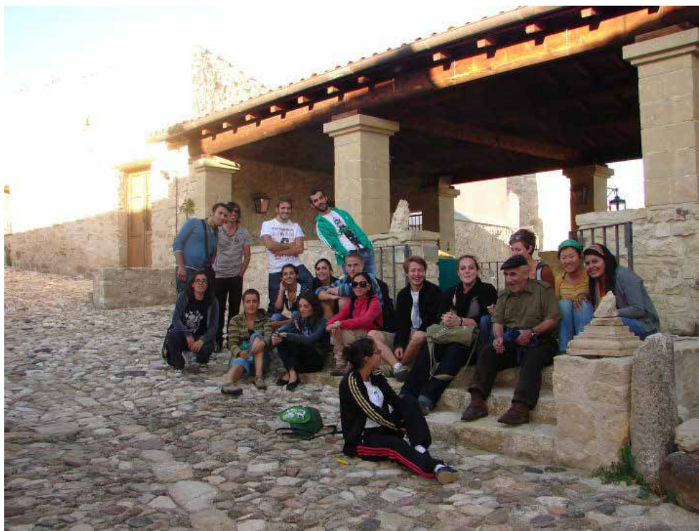
Our first youth exchange “Be Part of It” - 2011

During four years of experience as an informal group, Giovani Iddocca took part in various youth exchanges in France, Bosnia-Herzegovina, Slovenia, Montenegro, Turkey and Cyprus, during which different groups of young people from Sardinia lived great experiences for their personal and cultural growth. The group, in 2016, is going to found its official NGO called “IsLand 3.0”